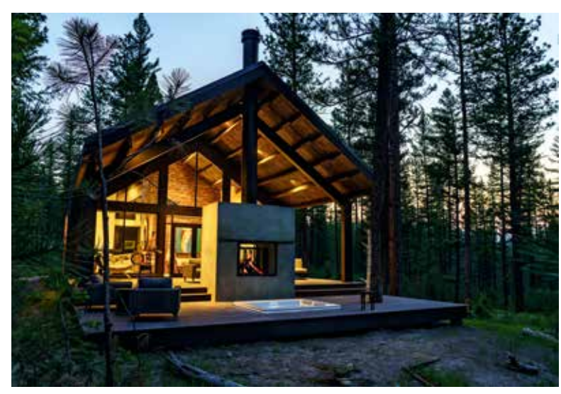
A Light Haus, a 100sq m guest chalet with a generous terrace and outdoor fireplace